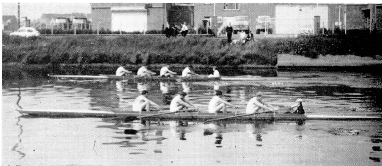
Thames and Leander Coxed Fours at Ostend, 1965