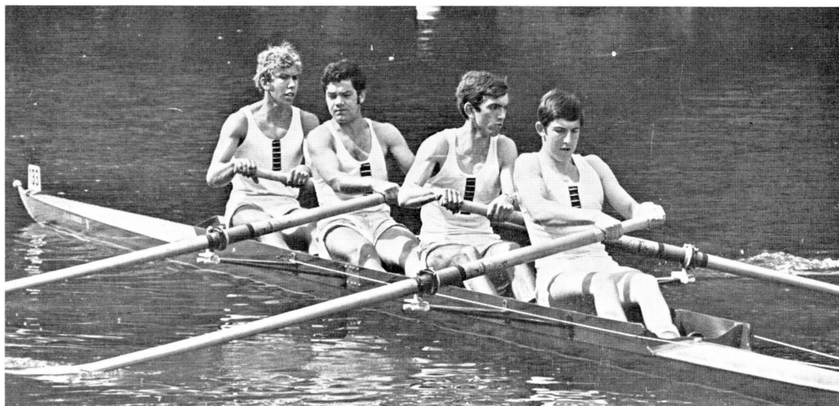
Wyfold Four at Henley