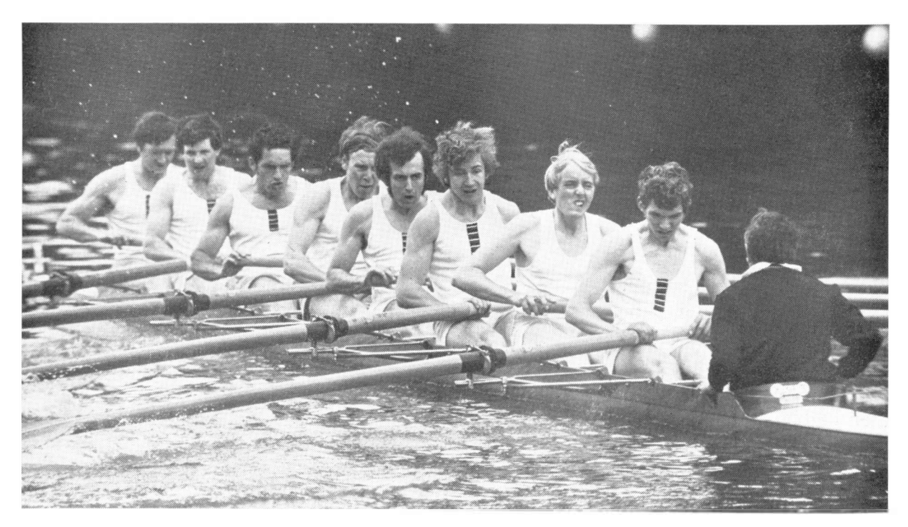
T.R.C. First Eight at Henley 1970