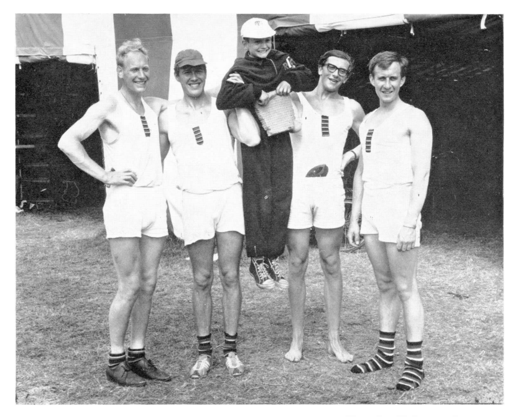
The Senior Coxed Four · 1965, 1966